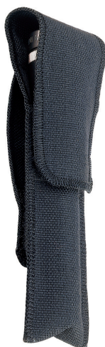
Mini Maglite® 2-Cell AA (AM2A056) Also available for Mini Maglite® 2-Cell AAA (AM3A026)