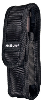
XL500® / XL200® (XLXXX-A3046)