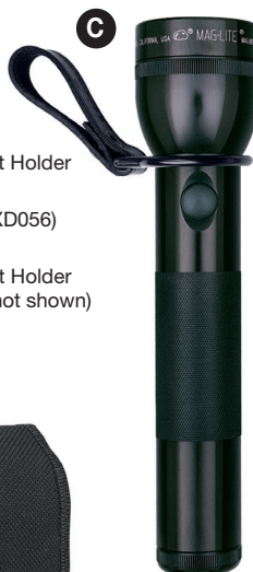
D-Cell Leather Belt Holder

Red (ASXX798) White (ASXX808) Yellow (ASXX508)