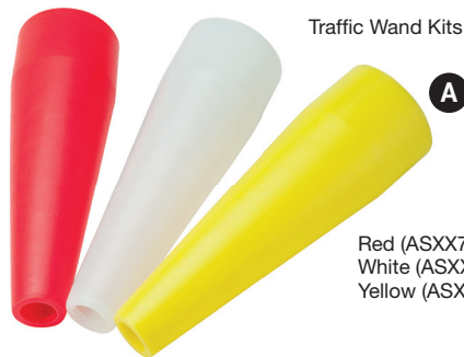
Traffic Wand Kits