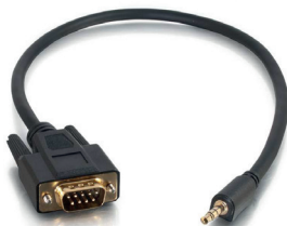
3.5mm to DB9 Serial Cable

Please check that the following contents are enclosed :